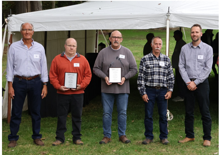
Pictured L to R: