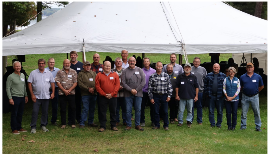
Current and newly inducted members of the ESI Hall of Fame who attended this year's induction event at Beaver Lake Woodlands.